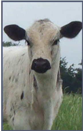
A good growthy, well marked heifer. Age 56 days.

Docile. British Whites are possibly the most gentle cattle of any beef breed. This trait alone makes them your ideal choice whether you raise cattle as a hobby or on a commercial basis. Research has proven that gentle cattle do better on feed and hang a better carcass.