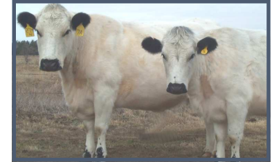
Standard Marked British White Pair. A 13 year old British White Cow with her coming two year old heifer. An exhibit of longevity and consistency.

British Whites are a Rare Old English breed maintained with and selected for those beef cattle traits so needed in today's cattle industry.