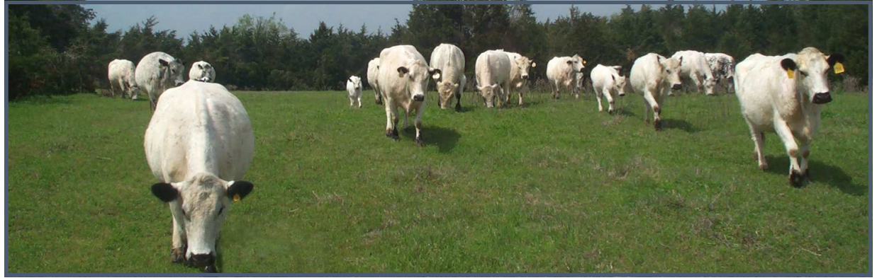
Moving to another pasture, note their gentle nature & willingness to follow.

Fertility, Easy Calving & Excellent Milking Ability. The single most economic trait in the Beef Cattle Industry is the ability of a cow to give birth to her first calf at two years of age and then give enough milk to raise it on her own. Her second and each subsequent calf should arrive within 12 month intervals.